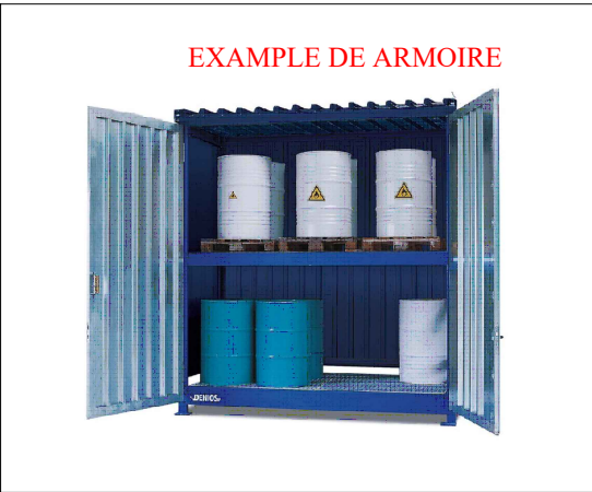
EXEMPLE DE ARMOIRE

VOIE COMMUNALE n°5 de SAINT-PRIEST à MARENNES